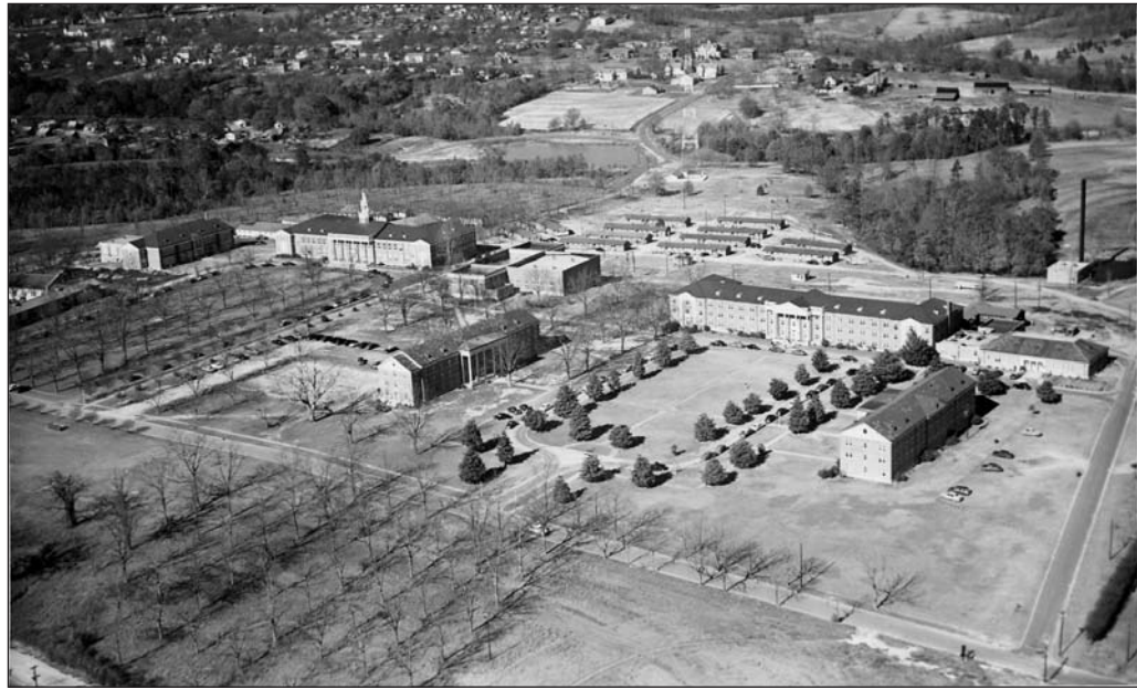
This aerial view of the Troy Campus, circa 1950, demonstrates the growth the University has experienced over the last 56 years. Among the buildings shown are Pace, Shackelford and Bibb Graves halls. The University is once again looking to the future as it embarks on “Troy University: Vision 2010,” a strategic plan that was approved by the Board of Trustees in March (see related story beginning on page 16). The plan maps out strategic objectives for the University in areas of academics, student-centeredness, cost-effectiveness and infrastructure, internationalization, faculty and staff development and telling the TROY story.