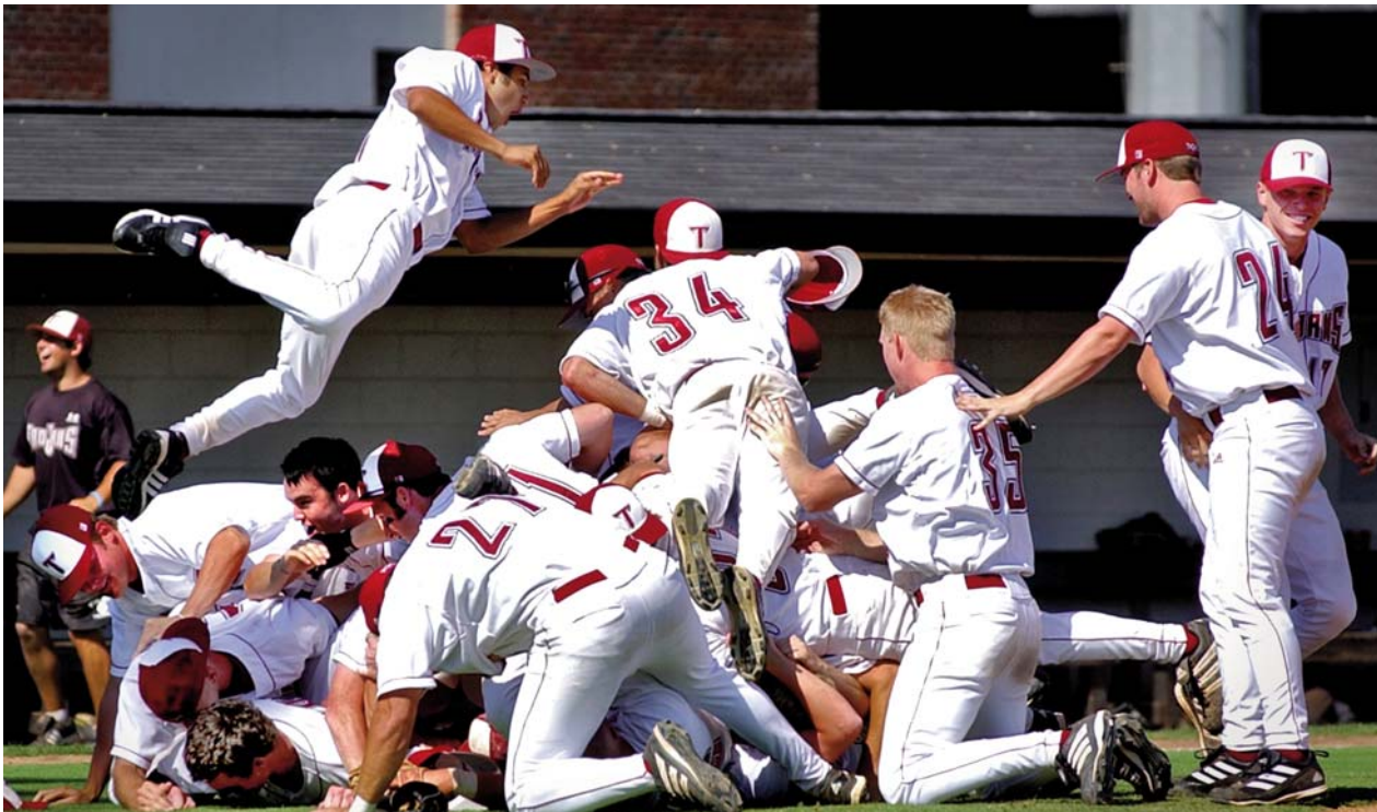
The Trojans celebrate after winning the Sun Belt Conference regular-season title with a come-from-behind victory over Middle Tennessee in front of the home fans at Riddle-Pace Field.