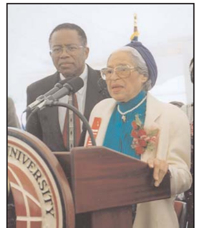
Rosa Parks speaks during a visit to the site of the museum honoring her role in Civil Rights Movement located on the Montgomery Campus.