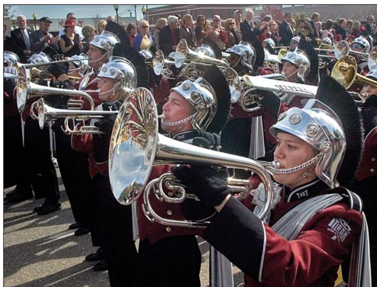
Troy University’s Sound of the South marching band, shown above performing during last year’s Homecoming parade, will be one of the focal points of the 2006 parade, which is scheduled for 10 a.m. on Nov. 4.