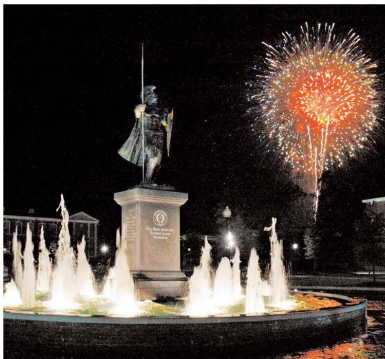
Best seat in the house. The Trojan warrior on the Bibb Graves quad appears to have had a good view of the Fourth of July fireworks display at Movie Gallery Veterans Stadium. The display was a part of the city of Troy's Fourth of July celebration.