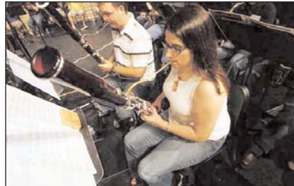
Troy University Symphony Band members perform selections during May recording session.