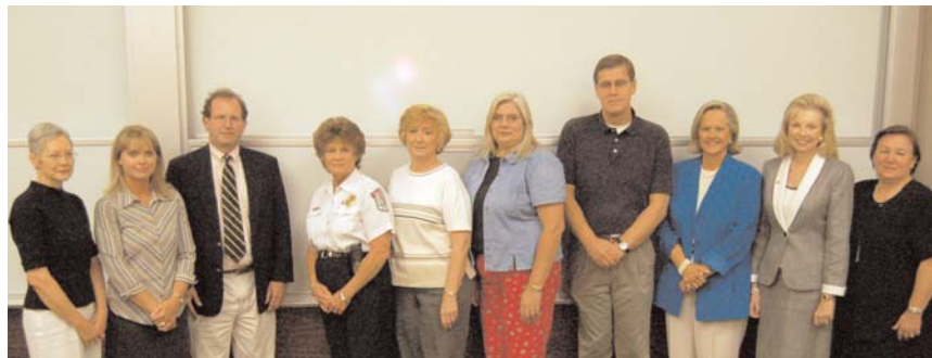
Service pin recipients were honored for their years of employment with Troy University during a ceremony in June.