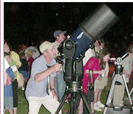
A tour of the night sky. Visitors to the 10th annual Astronomy Day at W.A. Gayle Planetarium in Montgomery on April 21 took advantage of the perfect weather conditions to take a tour of the night sky through telescopes provided by the Auburn Astronomical Society. The day featured a variety of activities including a planetarium show and a telescope clinic. The planetarium is operated for the City of Montgomery by Troy University.

His first professional photographing job would come under the auspices of the Farm Security Administration. While at FSA, he created the famed "American Gothic" photograph. While shooting documentaries for FSA, Parks also launched into glamour and beauty photography, completing projects for Vogue and Glamour magazines. In 1949, he joined the staff of Life magazine, where he stayed for some 25 years.