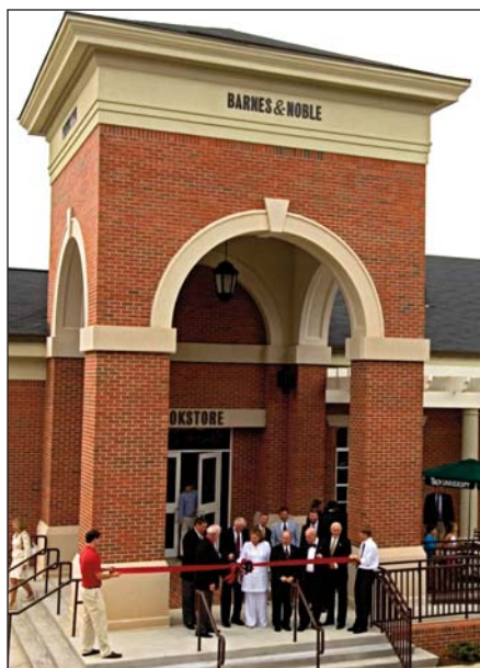
TROY officials cut the ribbon on the new Barnes & Noble University Bookstore.