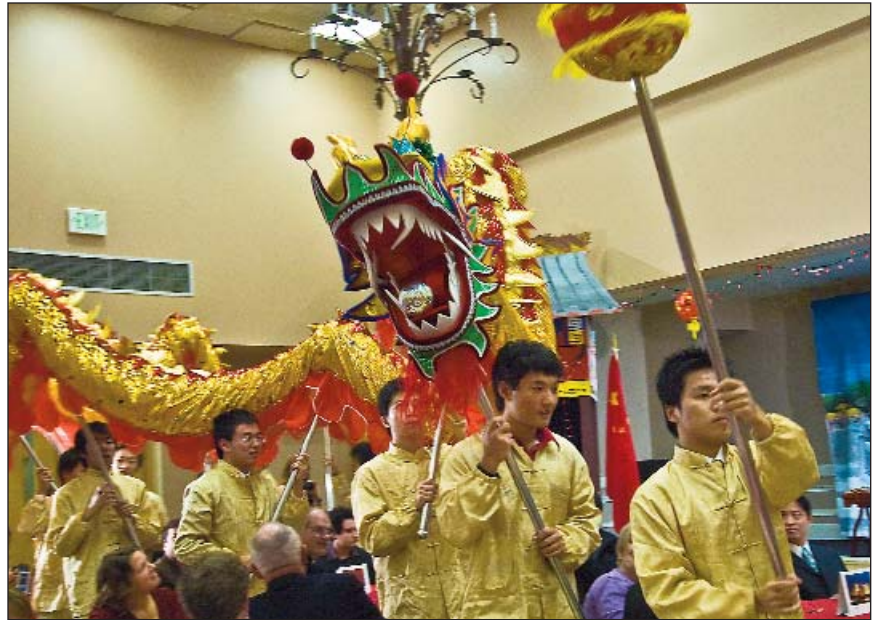
The Chinese New Year celebration, rescheduled to Friday, Feb. 26, will feature the traditional Dragon Dance. The annual event, sponsored by the University's Department of International Programs, the Chinese Student and Scholar Association and the Confucius Institute of Troy University, will begin at 6:30 p.m. in the Trojan Center Ballrooms.