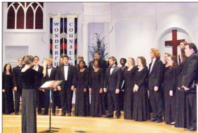
The John M. Long School of Music's Choral Department performs during its fall concert. The department's spring concert is set for March 28 at Bush Memorial Baptist Church.