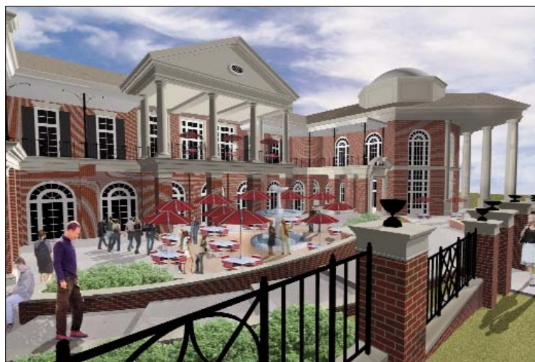
An artist rendering shows plans for the new dining hall facility on the Troy Campus. The new facility is expected to seat about 1,000 students and will include a courtyard dining area.

The facility will feature four "all-you-can-eat" styled dining venues, a retail dining venue and an exterior courtyard on the first floor. Its second floor will house one "all-you-can-eat" styled dining venue, a retail dining venue and two civic meeting rooms. In addition it will be connected to