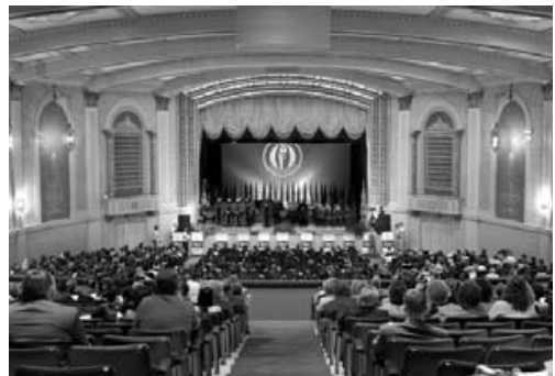
Troy University's Davis Theatre - Present