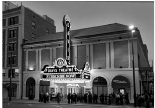
Troy University's Davis Theatre - Present