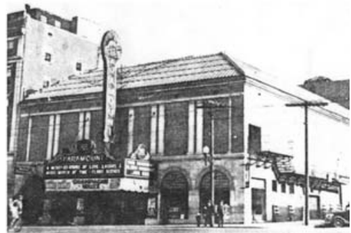
Paramount Theatre - Circa 1930