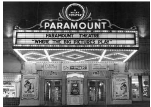
Paramount Theatre - Circa 1959