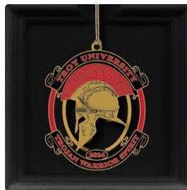
2014 Edition $15.00