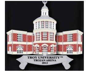
2012 Edition $15.00