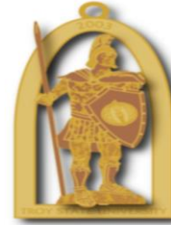
2003 Edition $10.00