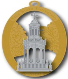
2000 Edition $10.00