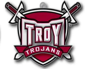
2005 Edition $10.00