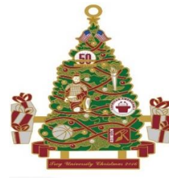
2017 Edition $20.00