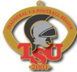
2001 Edition $10.00