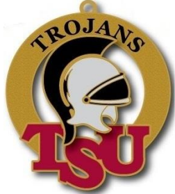
1999 Edition $10.00