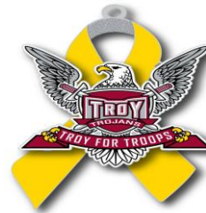
2010 Edition $15.00