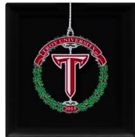
2015 Edition $15.00