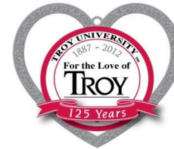
2011 Edition $15.00