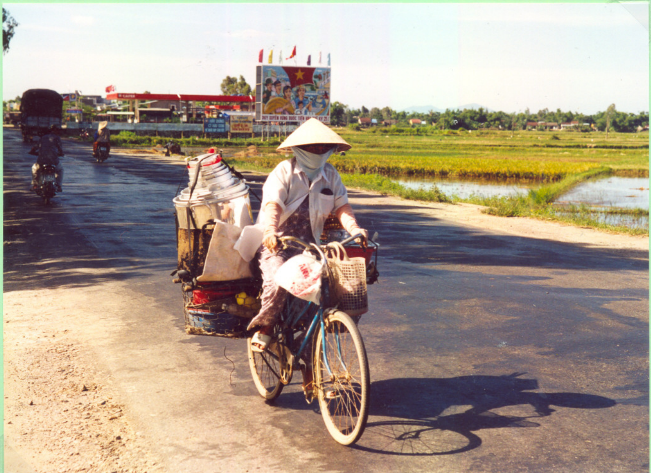
Highway One - 2002