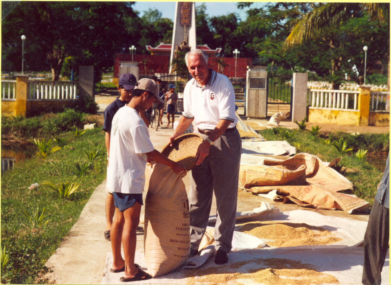
Location of KMC encampment. Home of 3rd Platoon, Delta Company, 9th Engineer Battalion - 1968.

We were always surrounded by smiling children in Vietnam. Near DaNang, it was the season for harvesting the rice crop, and everywhere we looked, we found people drying the rice and packing it up to store or to send to the market.