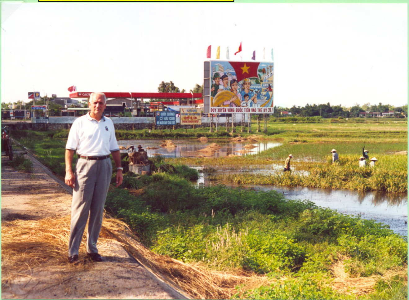
Ambush site - 8 command-detonated mines - 4 May 1968