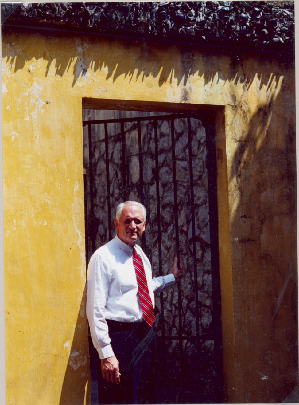
A visit to the Hanoi Hilton where POW's were imprisoned.