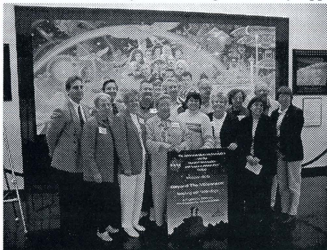
Pictured above is the first group of University Teacher Educators to have completed the Beyond the Millennium Conference at Kennedy Space Center. The conference, sponsored by the Astronaut Memorial Foundation, was held to promote the use of technology in American classrooms.